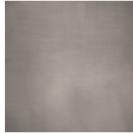
Pewter - PWT